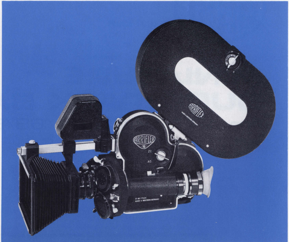
The Miniature Duro-Pack Battery mounted on the beam of the Arriflex 16S matte box by means of an adapter. (Front cover picture shows battery mounted on camera accessory shoe.)

The batteries are well constructed, sturdy power packs, made to stand up to the hardest location use. They