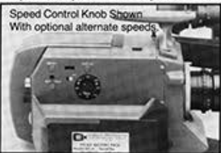
Speed Control Knob Shown With optional alternate speeds.

(0-140°F) for all crystal-controlled step-variable speeds from 12 to 64 fps.