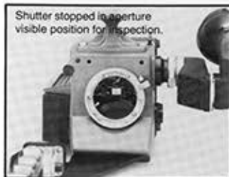
Shutter stopped in aperture visible position for inspection.

Other Options and Accessories: J-5 Power Zoom Control; Cinevid Video Assist; Steadicam Camera Stabilizing System; CP Camera-prompter; adjustable handgrips, cases, etc. Adaptable to optical or magnetic time code.