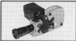
GSMO shown with Cinevid-16 Video Assist Camera.